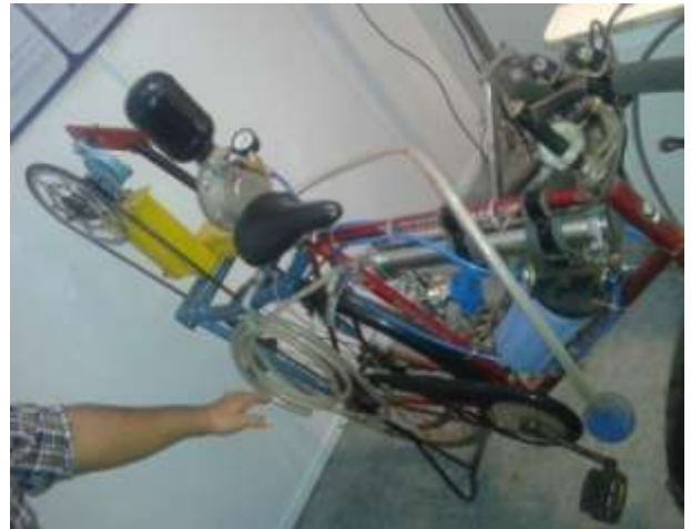
Filtration Unit on Bicycle peddle