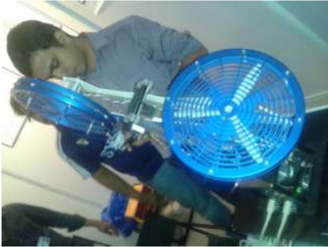
3-DOF Helicopter Rain water harvesting unit