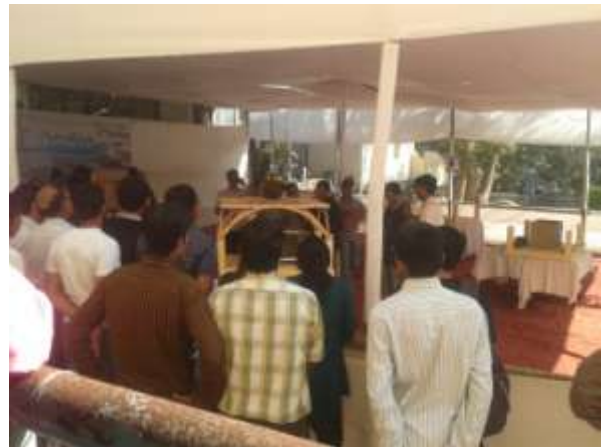
Students visiting Various Technical Events