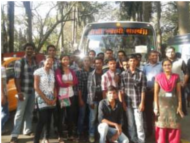
Students and staff From GIT at IIT Bombay