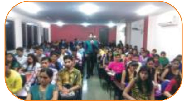
Workshop - Hybrid Application Development & Cross Linking Platform -PhoneGap Technology