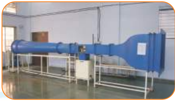
Applied Hydraulics Laboratory