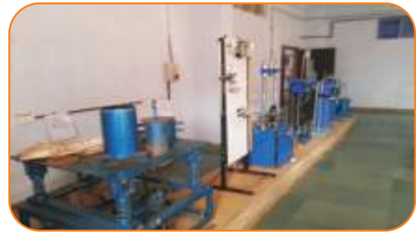
Geotechnical Engineering Laboratory