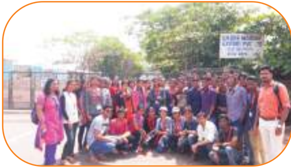
Industrial Visit - Gadre Marines Exports Ltd.2015-16