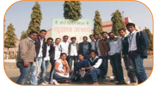
GIT students in Auro Spinning mills