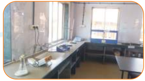
Environmental Engineering Laboratory