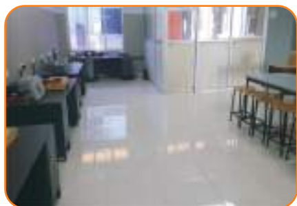
Electronics Design Laboratory