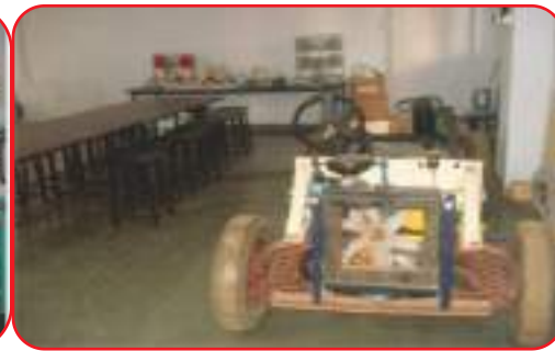
I.C.Engine & Automobile Laboratory