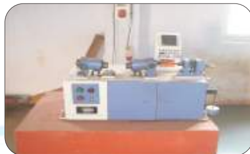
Material Technology Laboratory