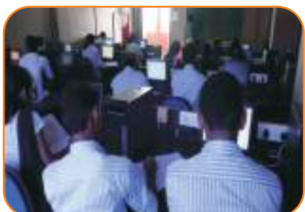
Project and Simulation Laboratory