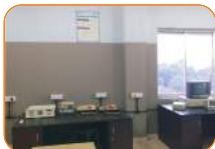
Advanced Communication Laboratory