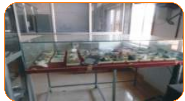
Engineering Geology Laboratory