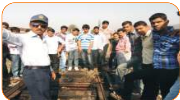
Industrial Visit to Chiplun Railway Station (2014)