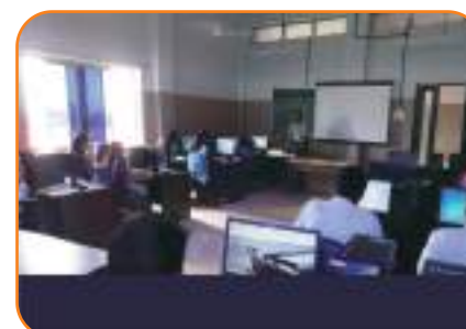
New Software Laboratory