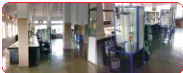
MASS-TRANSFER OPERATION LABORATORY

The department is equipped with 11 laboratories including analytical laboratory and has computational fluid mechanics (CFD) software, departmental computer centre, and departmental library, seminar hall, and classroom with modern teaching aids