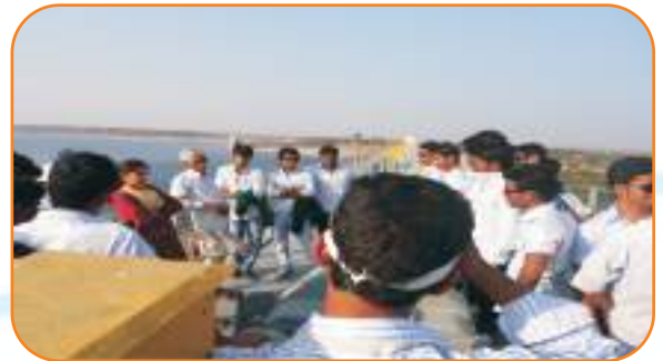
Visit to Nagarjun Sagar Dam, (2014)