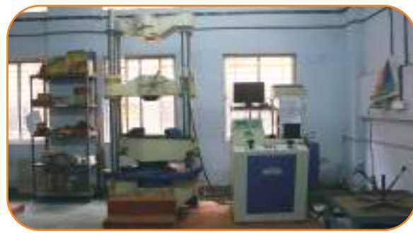
Concrete Technology Laboratory