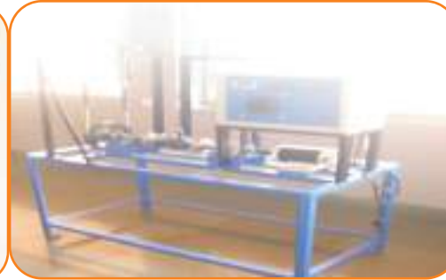
Theory of Machine Laboratory