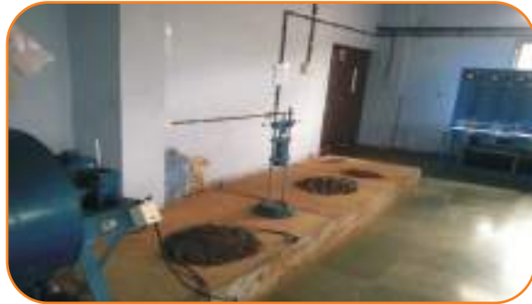
Transportation Engineering Laboratory