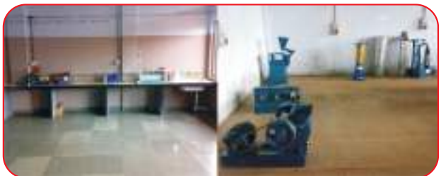
SOLID-FLUID MATERIAL OPERATION LABORATORY