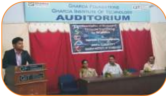
Cyber Scene Investigation Workshop