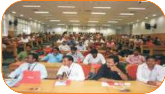
GIT Students in Infosys, Bangalore